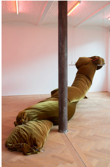
L'Amour est plus froid que la mort III , year: 2016. material: Velvet, polystyrene, steel, plexiglas. Dimension: around 600 x 150 cm.

Are you someone who always needs to be working on something? Do you ever have time where you're like, "I have this window of time where I don't have any projects, I could just go travel and not think about making anything."