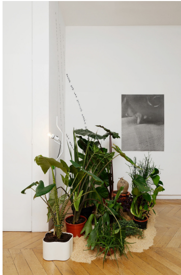
The Him + Maisons Françaises, une collection n°159 (poster). year: 2017. material: plants, sand, two lamps Toio,. Designer Castiglioni, Publisher Flos, 1962, various dimensions, poster. Courtesy of the artist and Galerie Allen, Paris. Co-production: Lab'bel & Galerie Allen. Courtesy of the artist and Galerie Allen, Paris