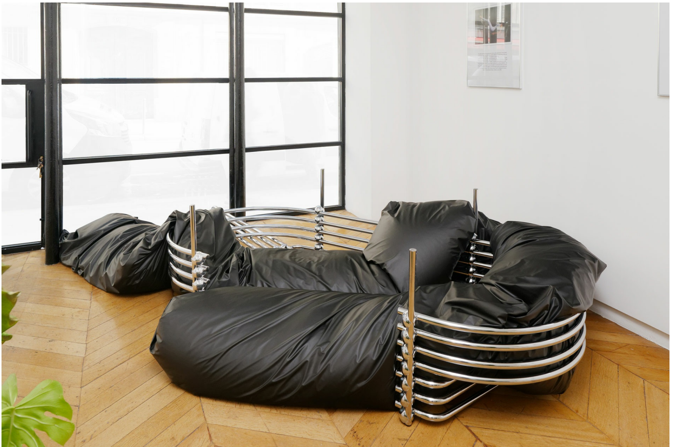
L'Amour est plus froid que la mort IV . year: 2017. material: Steel, skaï, polystyrene, various dimensions.

When you're working on these large-scale, site-specific pieces, is a lot of the work just coming up with proposals and applying for residencies and grants and things like that? And given the fact that your work varies so wildly from piece to piece in terms of materials and format, does that make it harder for people to get a handle on what you and your work are all about?