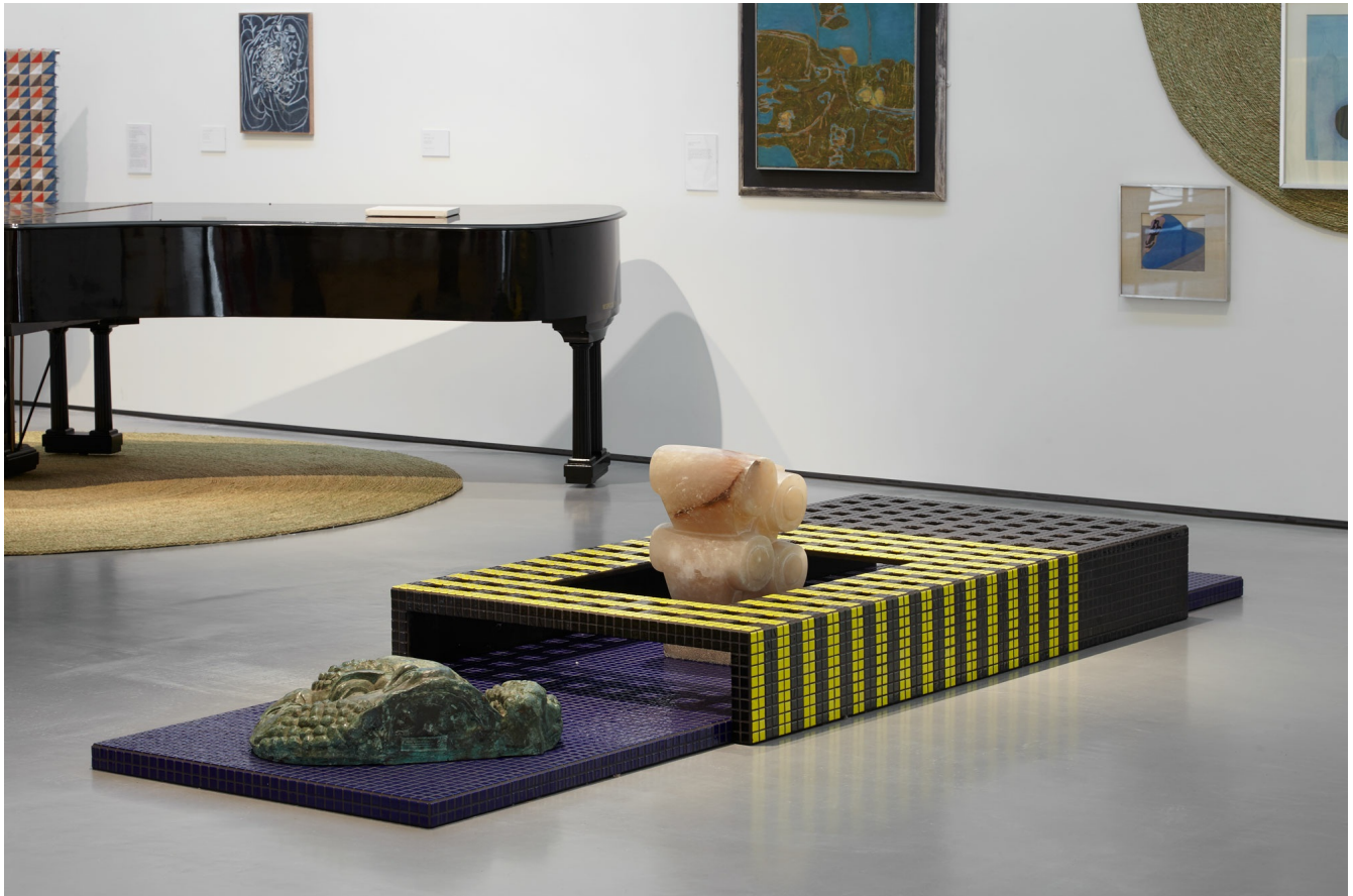
DB/S 8 , year: 2016, material: Wood, tiles, 400 x 105 x 270cm. With Forms , 1960 by George Kennethson And Ornamental mask , 1912 (posthumous cast) by Henri Gaudier-Brzeska ; Kettles's Yard collection, Cambridge. Production : Hepworth Wakefield, UK. Courtesy of the artist and Galerie Allen, Paris.

Sometimes the more difficult thing is that you get so many little invitations, little projects, and little solicitations, which are also very important and interesting, but which can be distracting. Sometimes you are invited to do something one year in advance, but sometimes it's just two months, or a few weeks even. That short time period doesn't allow you to do as much research, so maybe the work is more repetitive, or more of an experiment or a draft. That can be good, too. I think often things need to be imagined in an emergency. Urgency is very important. A deadline.