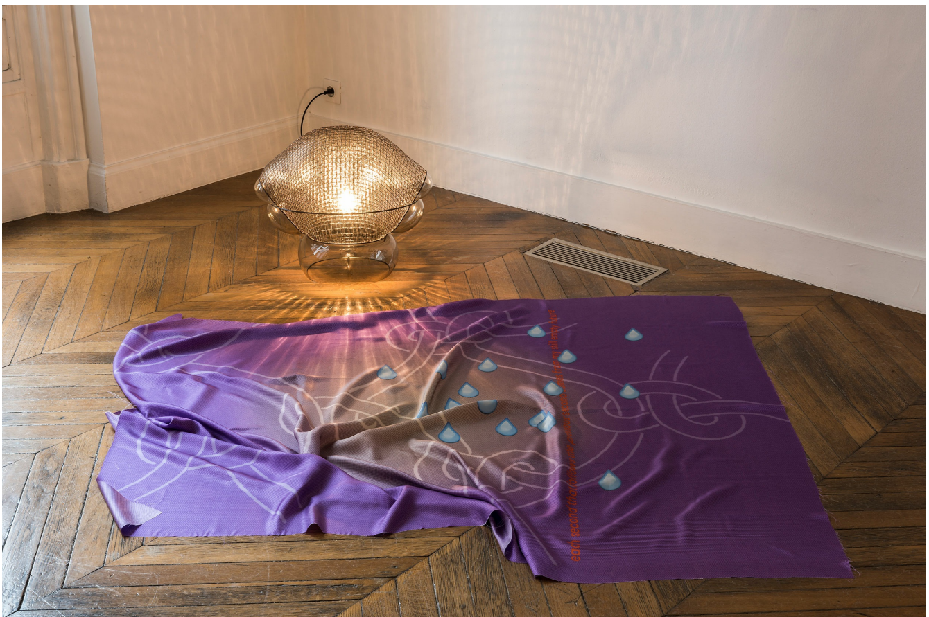
Scenius + Silkposter tesmainsdansmes chaussures. year: 2017 material: Patroclo [Gae Aulenti], 1975 / 1999, ed. Artemide + silk print, production : La Galerie, Noisy le Sec, FR & Cnap.

When you're working on a project and it feels like it's not working, or when you feel stuck, do you have certain tricks or things that you do to get out of that mindset?