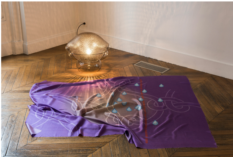
Scenius + Silkposter tesmainsdansmes chaussures. year: 2017 material: Patroclo [Gae Aulenti], 1975 / 1999, ed. Artemide + silk print, production : La Galerie, Noisy le Sec, FR & Cnap.

When you're working on a project and it feels like it's not working, or when you feel stuck, do you have certain tricks or things that you do to get out of that mindset?