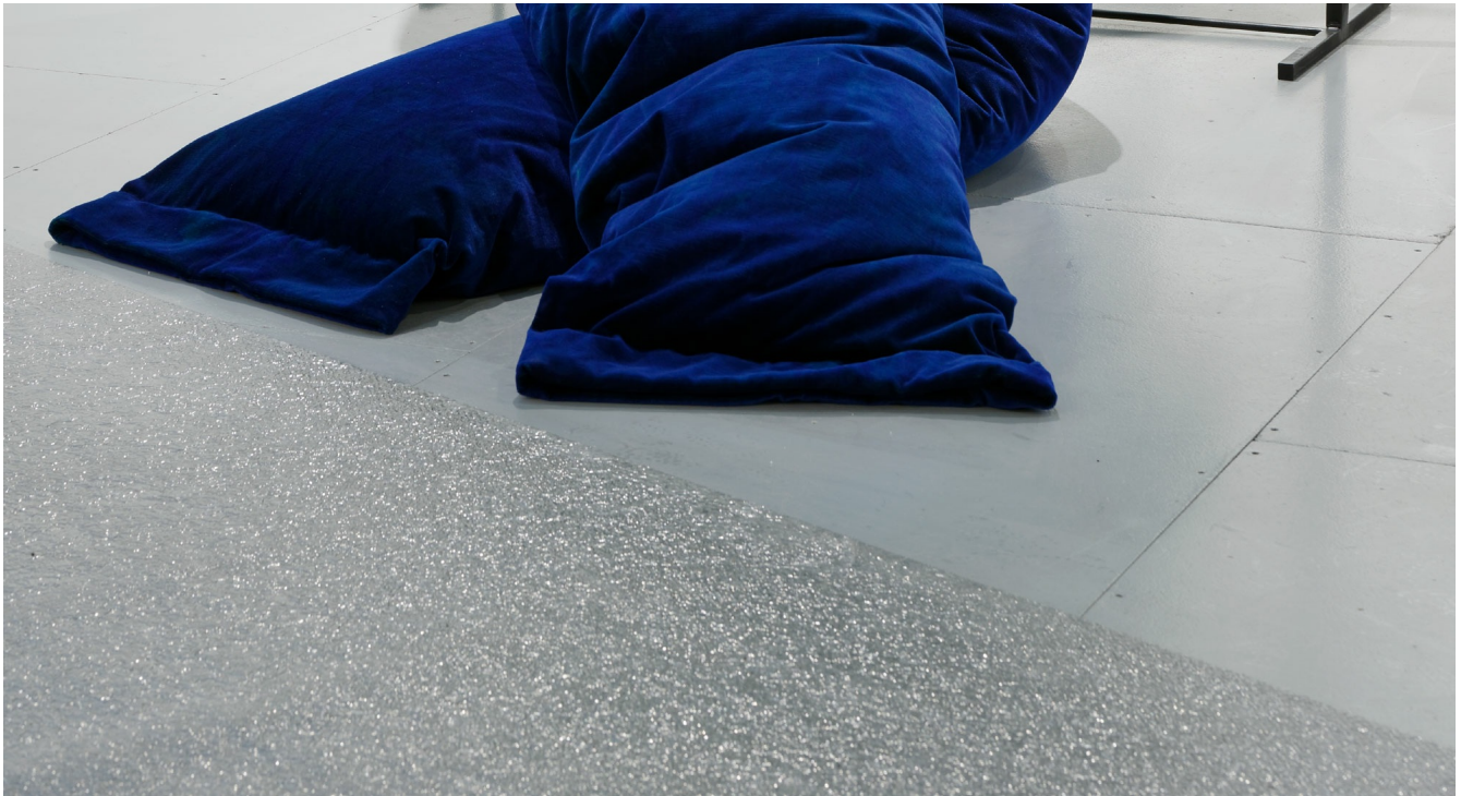
L'Amour est plus froid que la mort II . year: 2015. material: Velvet, polystyrene, steel, plexiglas. Dimension: around 600 x 150 cm.