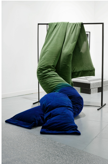
L'Amour est plus froid que la mort II . year: 2015. material: Velvet, polystyrene, steel, plexiglas. Dimension: around 600 x 150 cm.