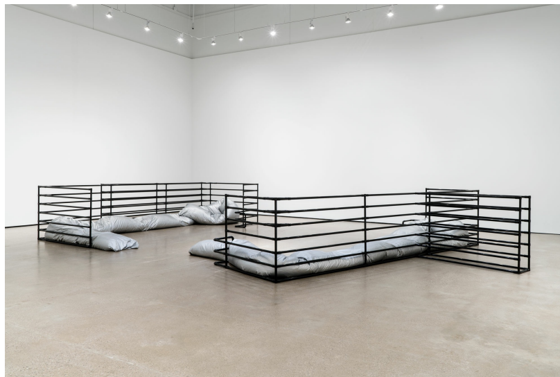
L'amour est plus froid que la mort VII . year: 2018. material: Skai, laminated metal, polystyrene. Production : Beeler Gallery, Columbus, USA.

I think the most important thing is to be absolutely focused, and to read and nourish yourself as much as possible. And not to let yourself be too swayed or distracted. For example, I love Instagram. It can be super inspiring, but mostly it's mentally polluting. It's very important just to make sure that my antennae is right, to be to aware of what things are a good influence and who or what is positive to my imagination and my mental health. We have to think about things in the long-term as well, don't we? Even if you don't uncover what you originally set out to find, or even if you don't get any feedback on something for years, it doesn't mean that you shouldn't have done the work. Just be clear about your intentions and try to develop tools that can help carry you the full distance. Being an artist is a long journey.