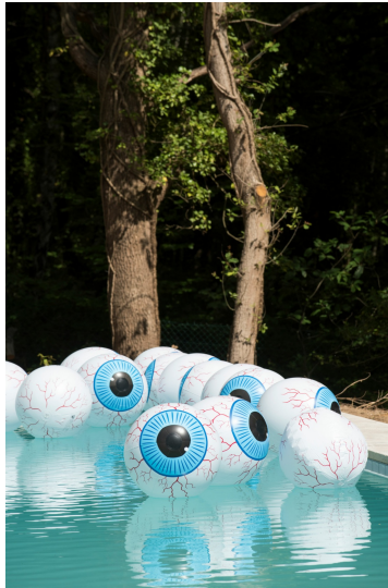
Dernier été , year: 2017. material: Twenty one inflatables and plastics balloons, 51cm diameter each. Production: Lab'bel.

Your work often comments not only on design—the way we consider physical spaces—but it also plays around with objects we think of as being utilitarian. Did you study architecture and design? They seem to inform your work.