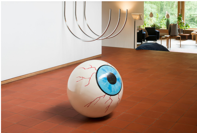
Gogolplex . year: 2017. material: resin, acrylic painting, diameter 60 cm. Production : Lab'bel. Courtesy the artist and Galerie Allen, Paris

I made these pieces that looked somewhat like very long, big sofas. It's a structure that takes up over six meters on the floor, with these very long cushions. I kind of think of them like convertible sculptures, so I've also been cutting them up and changing them. It's always interesting to see where the work is leading you. This sort of work began after I read Jean Genet's Querelle de Brest , which is what Fassbinder actually adapted into his last movie. At the time I was prepping a show in Brest, which is a city quite far away in France. In Genet's text there is really only one important female character and she is talking about the relationship between these two brothers. It's all about these questions around desire and mourning and death. She uses this metaphor about these two people made of damaged velvet being put together. In the beginning, I had this desire to express in some material and visual form the feeling behind that. This is how that one idea eventually became those pieces.