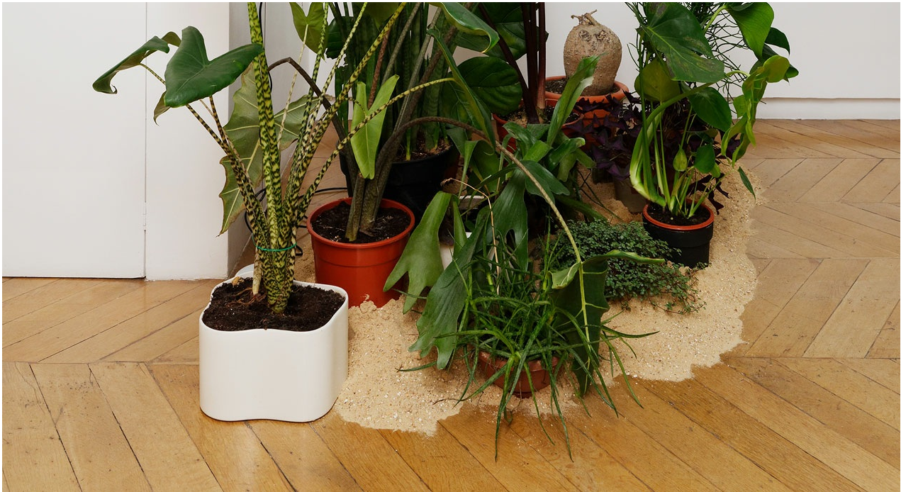
The Him + Maisons Françaises, une collection n°159 (poster). year: 2017. material: plants, sand, two lamps Toio,. Designer Castiglioni, Publisher Flos, 1962, various dimensions, poster. Courtesy of the artist and Galerie Allen, Paris. Co-production: Lab'bel & Galerie Allen. Courtesy of the artist and Galerie Allen, Paris