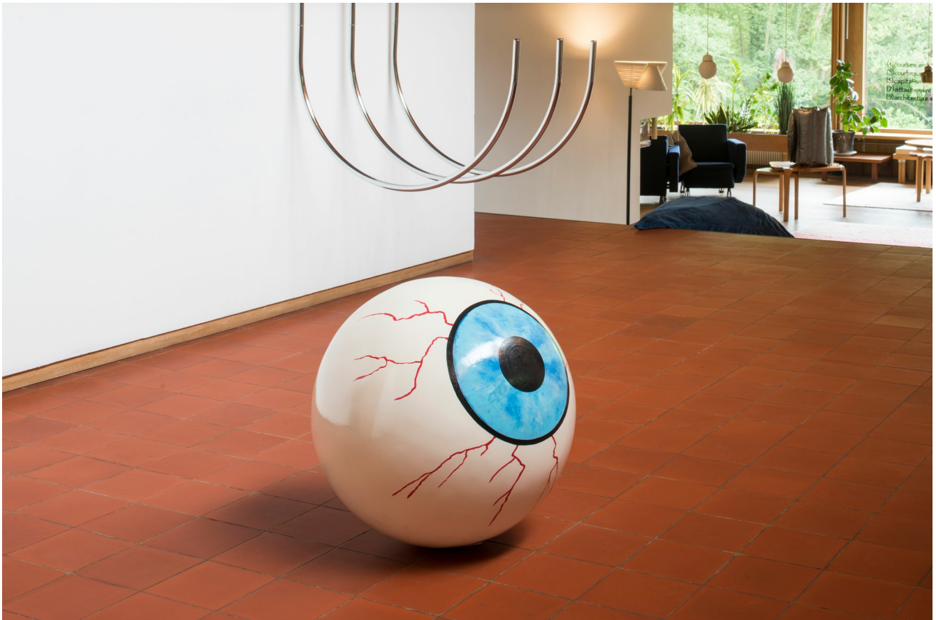
Gogolplex , year: 2017. material: resin, acrylic painting, diameter 60 cm. Production : Lab'bel. Courtesy the artist and Galerie Allen, Paris

I made these pieces that looked somewhat like very long, big sofas. It's a structure that takes up over six meters on the floor, with these very long cushions. I kind of think of them like convertible sculptures, so I've also been cutting them up and changing them. It's always interesting to see where the work is leading you. This sort of work began after I read Jean Genet's Querelle de Brest , which is what Fassbinder actually adapted into his last movie. At the time I was prepping a show in Brest, which is a city quite far away in France. In Genet's text there is really only one important female character and she is talking about the relationship between these two brothers. It's all about these questions around desire and mourning and death. She uses this metaphor about these two people made of damaged velvet being put together. In the beginning, I had this desire to express in some material and visual form the feeling behind that. This is how that one idea eventually became those pieces.