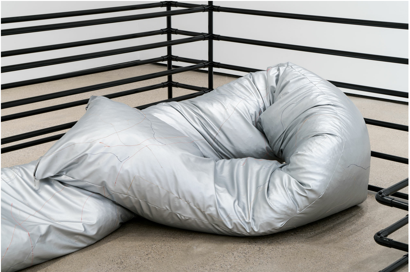
L'amour est plus froid que la mort VII . year: 2018. material: Skaï, laminated metal, polystyrene. Production : Beeler Gallery, Columbus, USA.